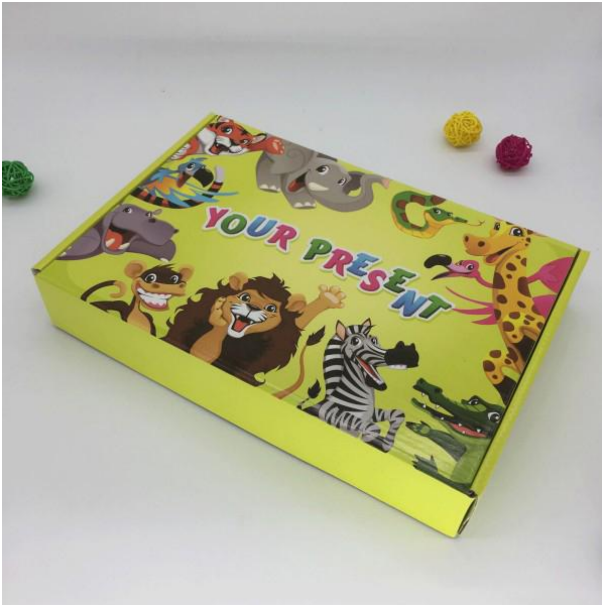
Sinst Pizza Box for Paintbrush Process